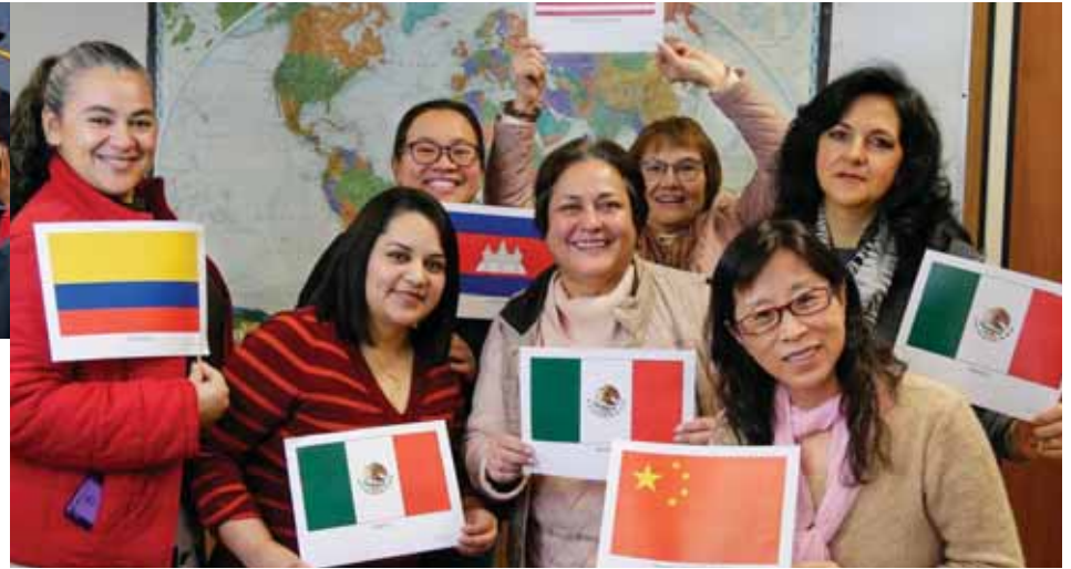
Every day, students from diverse backgrounds hone their skills to become better English speakers.